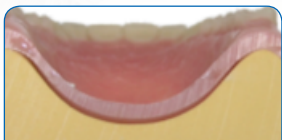
Other dentures. Lifting caused by shrinkage and poor fit.